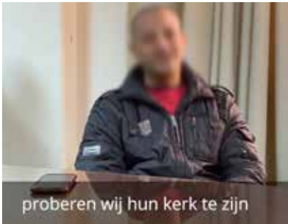
Picture blurred for security reasons