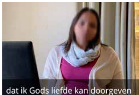
Picture blurred for security reasons

Through Isaiah 54 I discovered my vocation for women's ministry. That's why I went to study counselling so that I can better help and support the girls and women who come my way. I create content for the pages dedicated to targeting Arab women and engage them in online conversation. The content we provide very clearly meets a need of Arab women who are having a hard time, with marriage, parenthood, Arabic culture in which they often feel trapped: violence against women, lack of freedom, the great pressure on women. I often notice that God touches and heals their deep pain, through our content and the follow-up we can provide."