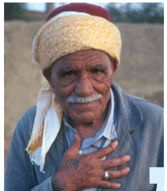
Picture does not portray the man from the story.